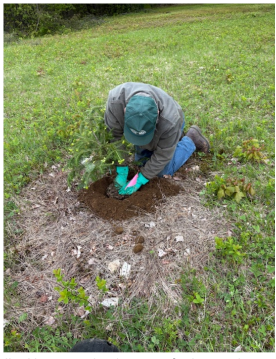
Jim Hummer planting a grafted transplant into Huff Hill seed orchard.