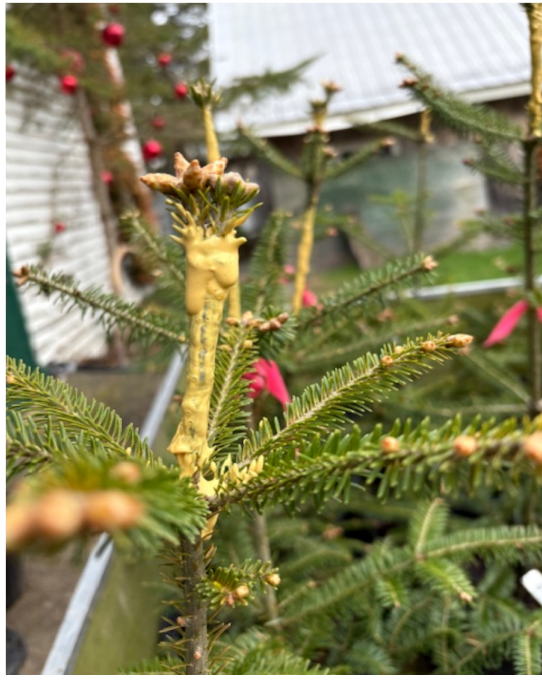
Final graft of superior needle retention scion onto root stock.