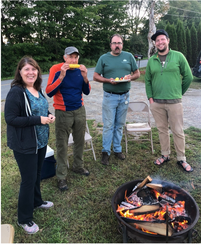
Having fun at Friday evening's barbeque.