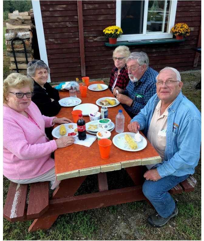
More fun at Friday evening's barbeque.